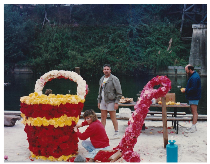
Kids beach bucket and shovel getting last minute attention