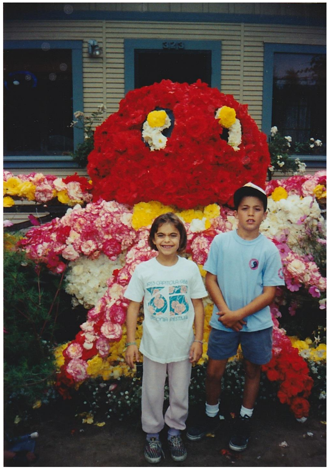
Kinstler extended family & Ctopus & Garden+with moving arms and blaring Beatle & music took 1st place