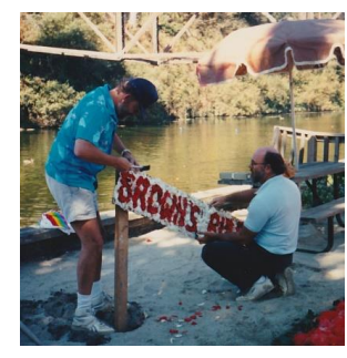
Last second Sunday morning revisionism

In that distant time, there were plenty of floats being built each year and more importantly, plenty of begonia blossoms to be picked, placed, and positioned in fanciful chicken-wire structures on decks and yards along the Creek and in the Village.